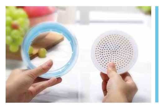
Traveling easily to tear down and carry

Place the water filter cup on the cup to remove impurities, is healthier when filtered out Impurity