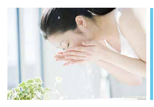
Washing for face Tap water is safer and cleaner after filtration