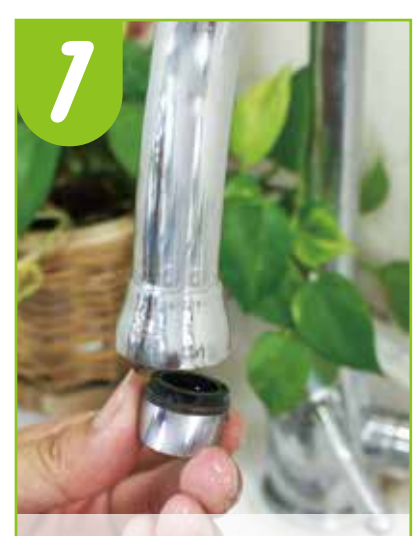
1.Unscrew the tap aerator Install nut

No need for professionals to change the design of pipe water supply, easy to install with your fingers