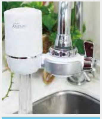
Clean water Clean and healthy water