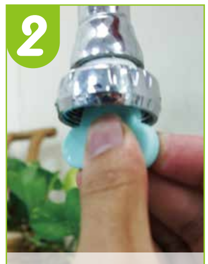
2.Install the silver nut and tighten it Choose one of 4 different connectors